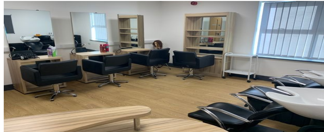
Beauty Room at the Headway Centre, Baysgarth School

Headway is an inclusion support provision at Baysgarth School funded by Department For Education (DfE) SEND Capital Funding . Headway includes a new two-classroom extension and a refurbishment of the Skills Centre on the site, to make the facility more practical and adapted to pupils' needs.