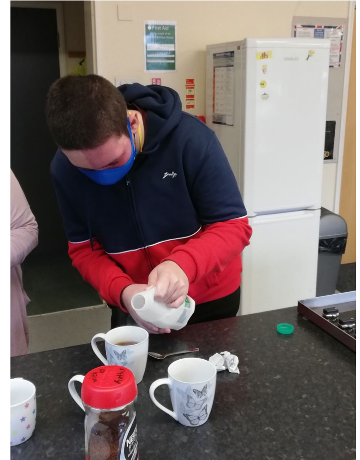
Independence within the Foundation Department covers skills needed from making a hot drink, snack or meal, to learning to use the washing machine, ironing, travel training and budgeting, to move towards independent living (John Leggott College)